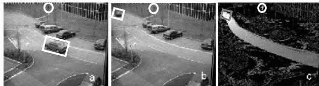
Fig. 1. Motion charge map: (a) one image of a sequence, (b) same perspective after some seconds, (c) motion trails as represented on the bidimensional motion charge map

Fig. 1 shows all these issues. Fig. 1a and Fig. 1b show two images of a monocular sequence. The advance of a car may be appreciated, as well as a more slight movement of a pedestrian. In Fig. 1c you may observe the effect of these moving objects on the permanence memory.